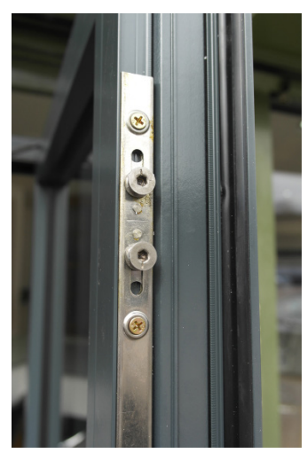
Espag Locking Mechanism