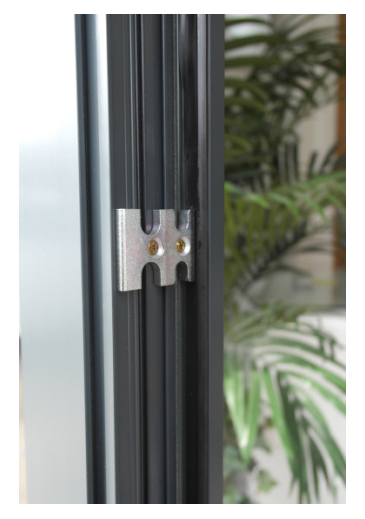
Espag Locking Keep